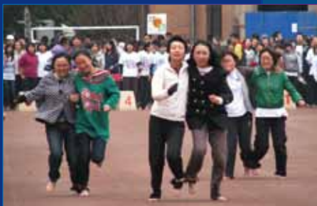
Freshman Barefoot Games