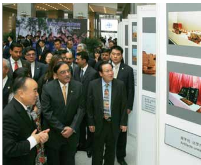
President Asif Ali Zardari at the Photo Exhibition