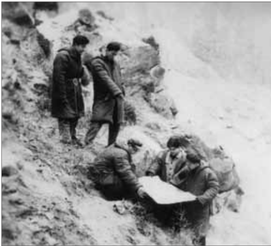
On-site measurement in 1960