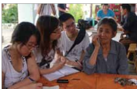
Investigations at Local Farmers' Homes