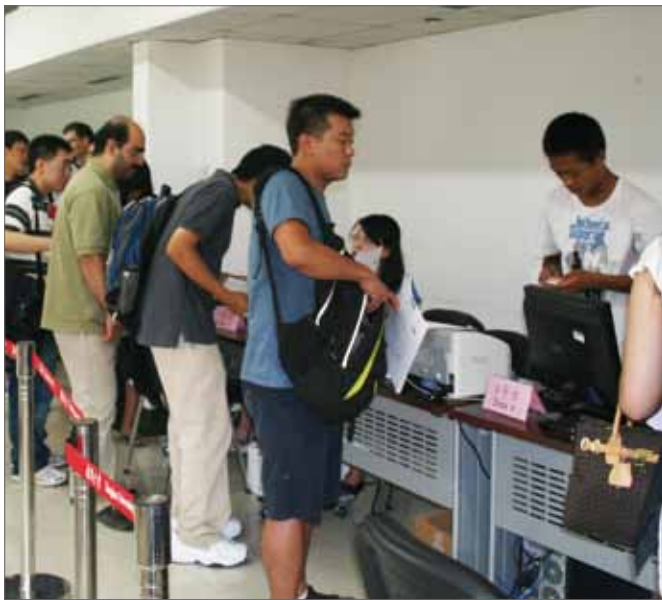
Registration for the New Term

By the end of September, the newly enrolled international students had all arrived at Tsinghua. Over 3,200 students from 122 countries are studying here this term, marking a historical high. About 1,240 of them are postgraduates.