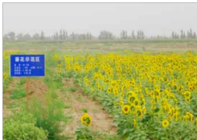
Sunflower field in FGD gypsum reclaimed saline-alkali soil

Professor CHEN Changhe from Tsinghua's Center for Ecological Restoration and Carbon Fixation of Saline-Alkali Land, who leads the technique team, stated that the water consumption of alkali soil reclamation by FGD byproducts is two-thirds less than the traditional irrigation approach. The heavy metal contents in FGD byproducts are much lower than those of soil background, and therefore no accumulation has been found. The heavy metal contents in reclaimed soil and crops grown in it are well below the national controlled levels. FGD byproducts reclamation is safe to soil, crops