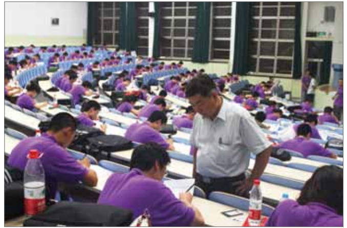
Written Session of the Design Competition