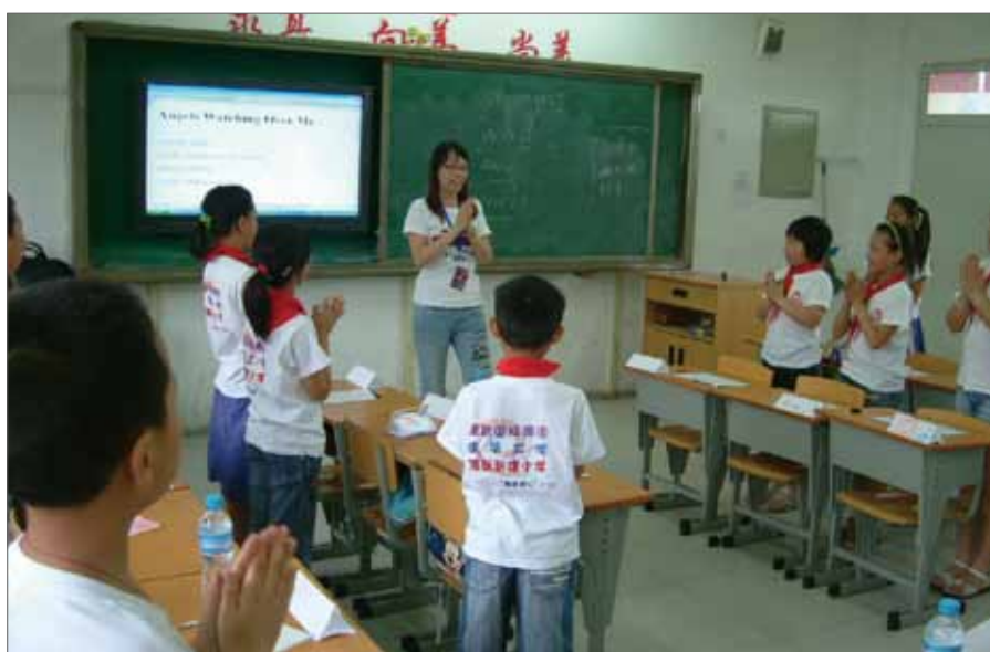
Volunteers Teach English in a Primary School