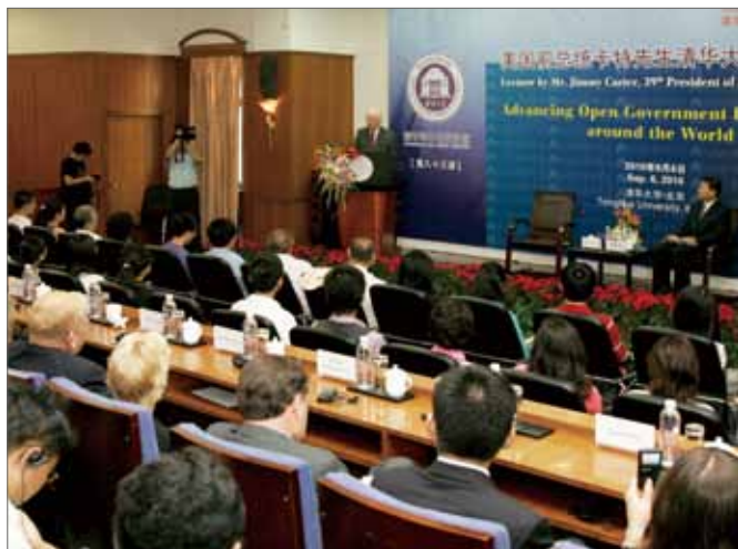
Mr. Jimmy Carter Lectures at Tsinghua

The Global Vision Lecture Series includes the Global Leadership Series and the Advanced Studies Series. The former includes lectures intended to promote students’ leadership capabilities, broaden their view of the world, and enhance their ability to compete in a globalized world. The Advanced Studies Series focus on providing students with state-of-the-art insights into academic research from a wide range of disciplines, ranging from natural science and engineering to social sciences and the humanities.