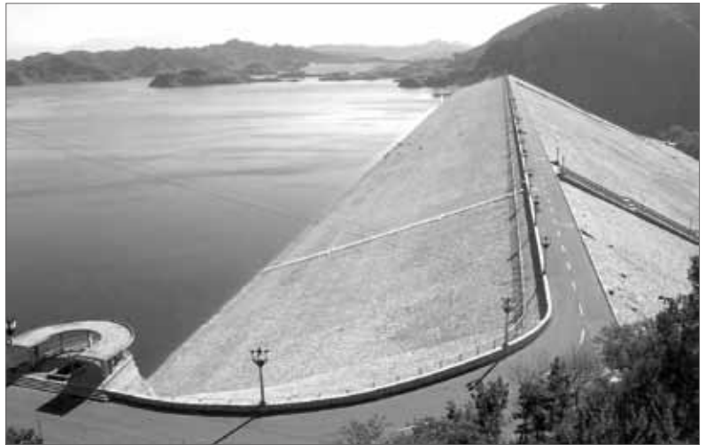
Reinforced Dam on the Chaobai River