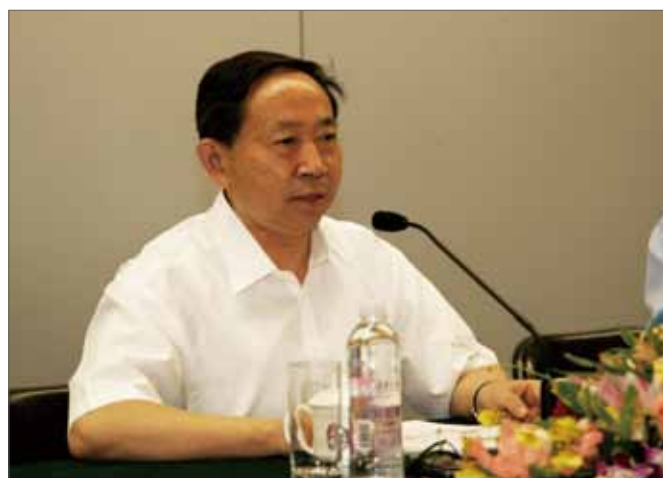
Minister of Education YUAN Guiren

After his speech, Minister YUAN visited the University's Research Center of Structural Biology and the Ancient Bamboo Strips at the Center for Excavated Texts Research and Preservation.