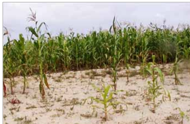
Corn field for comparison (Foreground: original saline-alkali soil; Background: FGD gypsum reclaimed saline-alkali soil)

Faculty members in the Department of Thermal Engineering have worked on the reclamation of alkali soils and investigated the influence of heavy metals on soils and